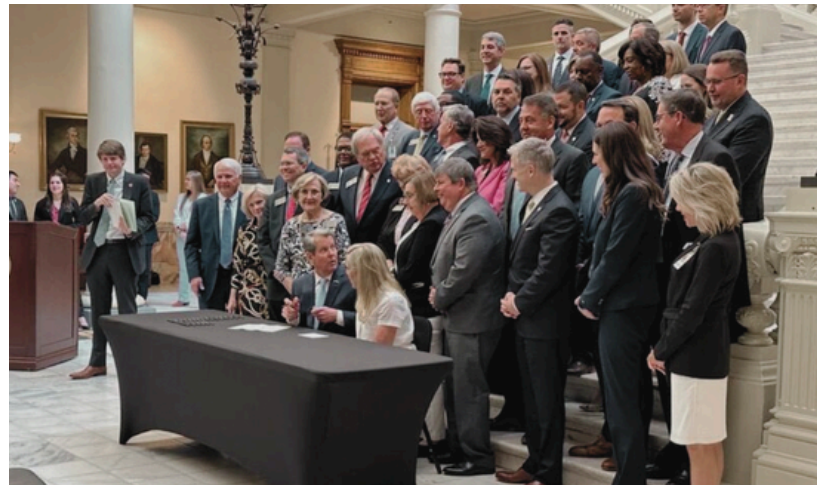
HEAL joins other supporters as Governor Kemp signed the biomarker testing bill, HB 85, at Georgia's State Capitol.