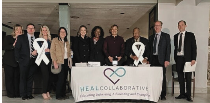
HEAL at Kentucky's State Capitol to support HB 180

Learn more about ACSCAN's biomarker campaign.