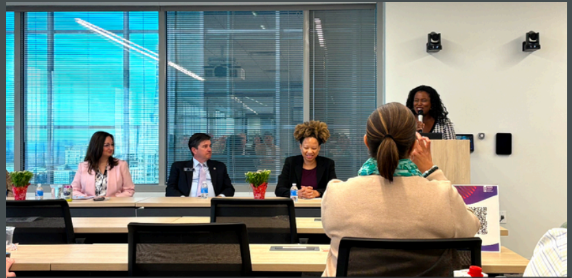
ACS CAN Georgia Health Policy Forum

Congressman Henry C. "Hank" Johnson, Jr. (GA-D 4th District) declares January 6 as HEAL Collaborative Day.