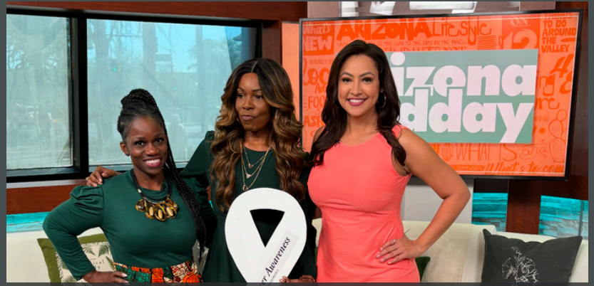
Arizona Midday 12News KPNX-TV NBC